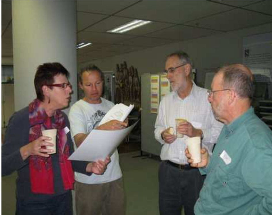
“Aren’t LogFrames fabulous!” Discussing ideas at the getting greener! project planning workshop:

NB: The Intermediate Outcome of Improved bushland, biodiversity and riparian health will be addressed to a small extent by projects within the Community Partnerships Program, but primarily through projects identified by the GRCCC River Health Monitoring Project and implemented by councils.