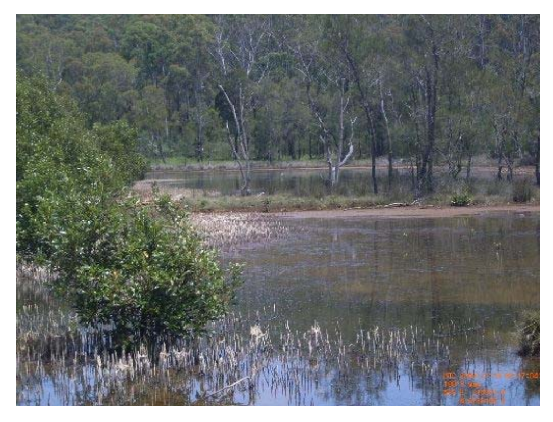
Plate 6: Wetland along Georges River in Georges River National Park - regeneration