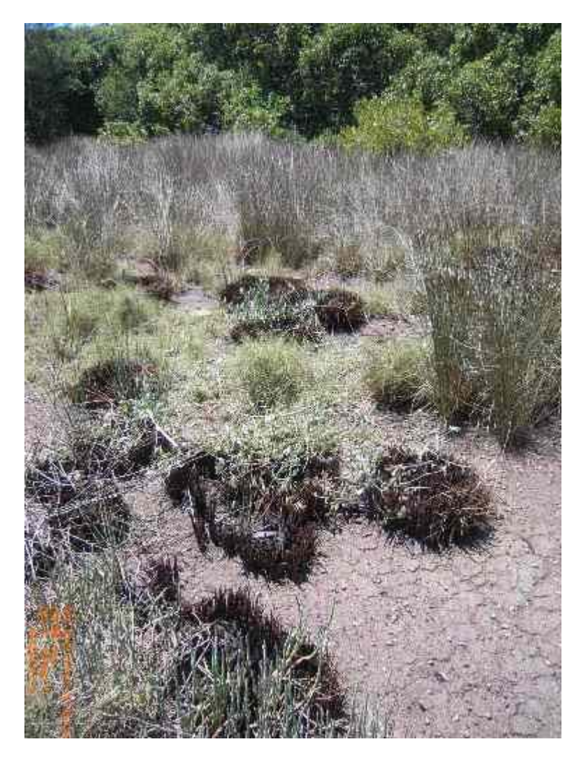
Plate 2b: Salt Pan Creek - Regrowth of Juncus acutus after control