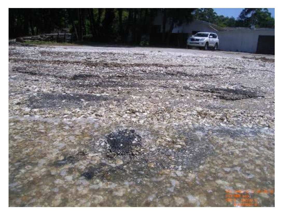
Plate 11: Remnants of the oyster industry observed at Neverfail Bay - tar pieces