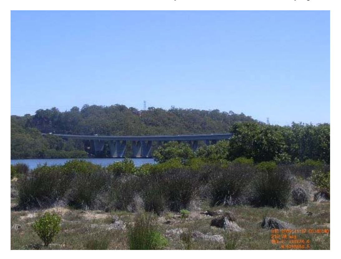
Plate 1: Juncus acutus removal at Beauty Point - hand removal and drying on site