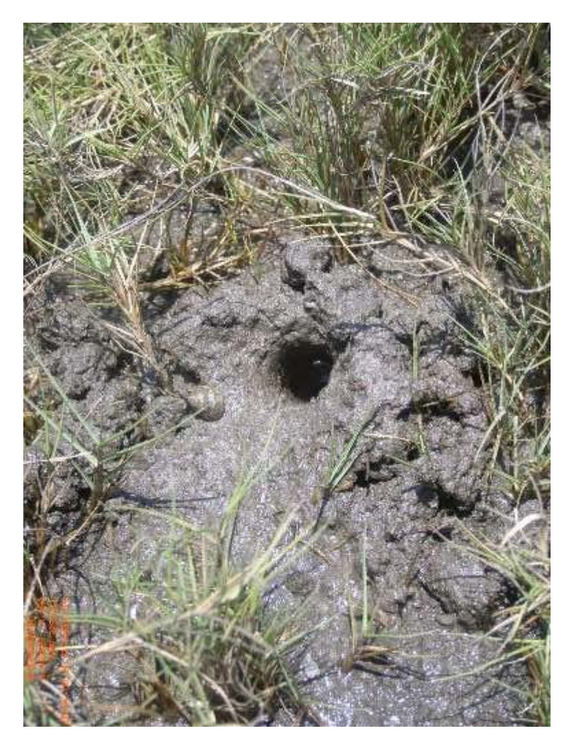
Plate 9: Crab species observed in Estuarine Mangrove Nature Forest

Plate 8: Snail species observed at salt marsh area at Towra Point Reserve