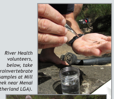
River Health volunteers, below, take macroinvertebrate samples at Mill Creek near Menai (Sutherland LGA).