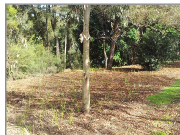
Revegetation works to protect remnant Blue Box species at Cook Park.