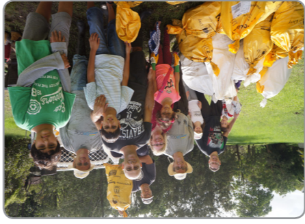
One of three Riverkeeper Clean Up Australia Day worksites for 2012, at Oyster Bay.

» Riverkeeper Report Card 2011/12, released August 2012